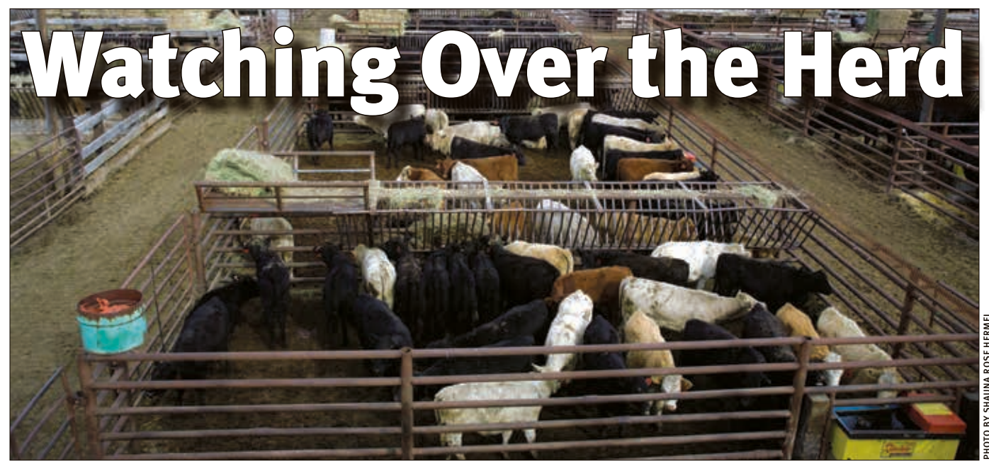
High cattle prices drive increase in theft. Cattlemen encouraged to take precautions.