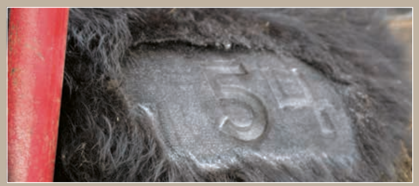
► Clipping a straight line helps position brands with multiple characters.