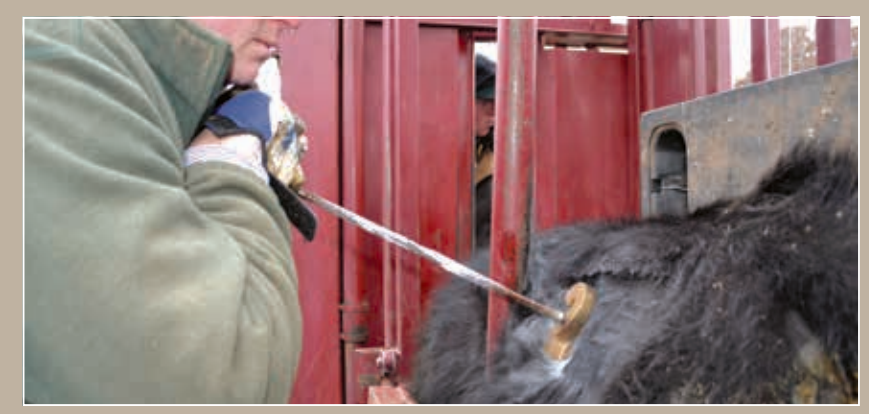
► After spraying the cleaned area with alcohol, apply the brand, holding in place for 40-60 seconds.