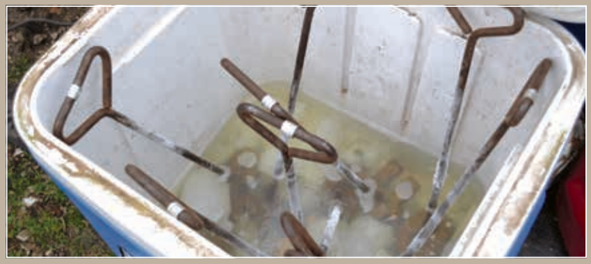
▶ There are multiple options when choosing a refrigerant.